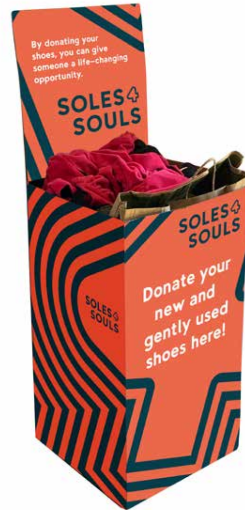
Concept direction for donation box design.