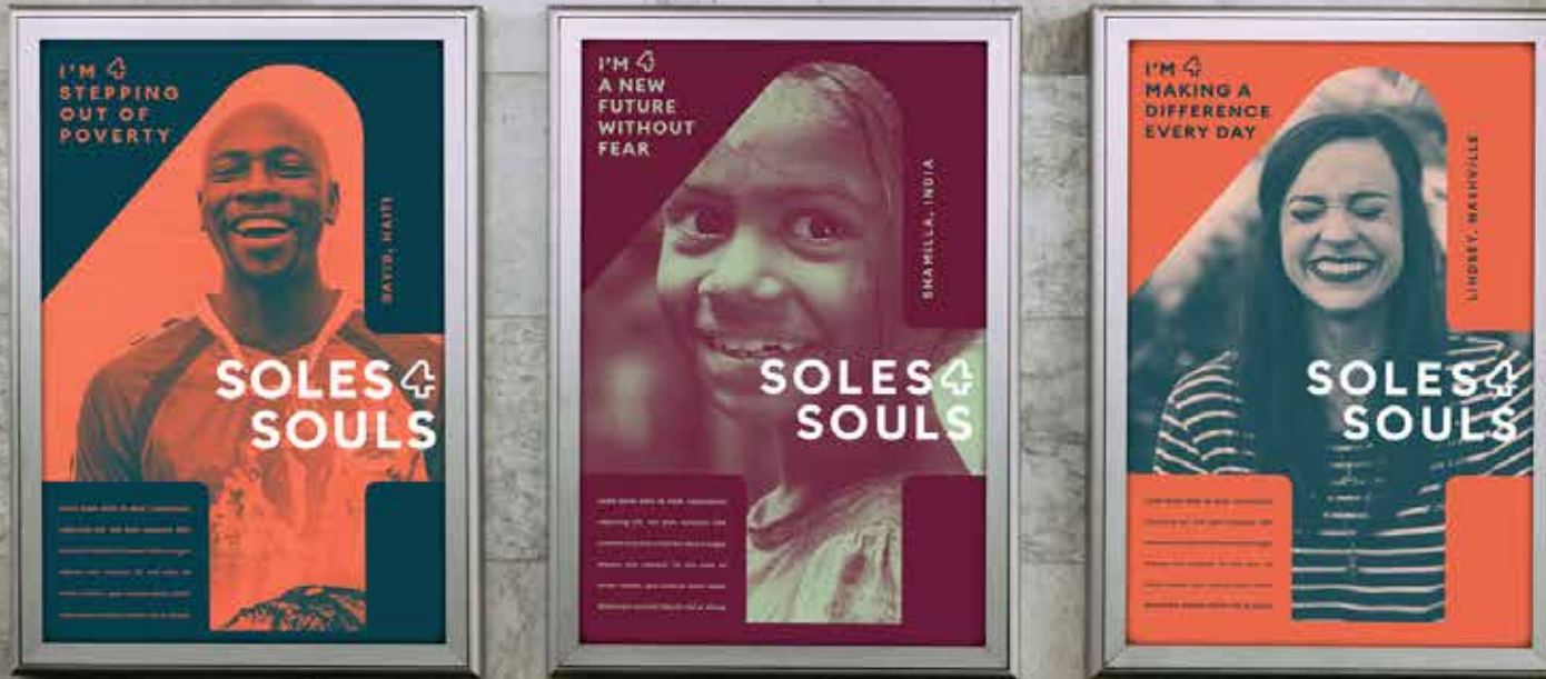
Concept of application for incorporating photography.