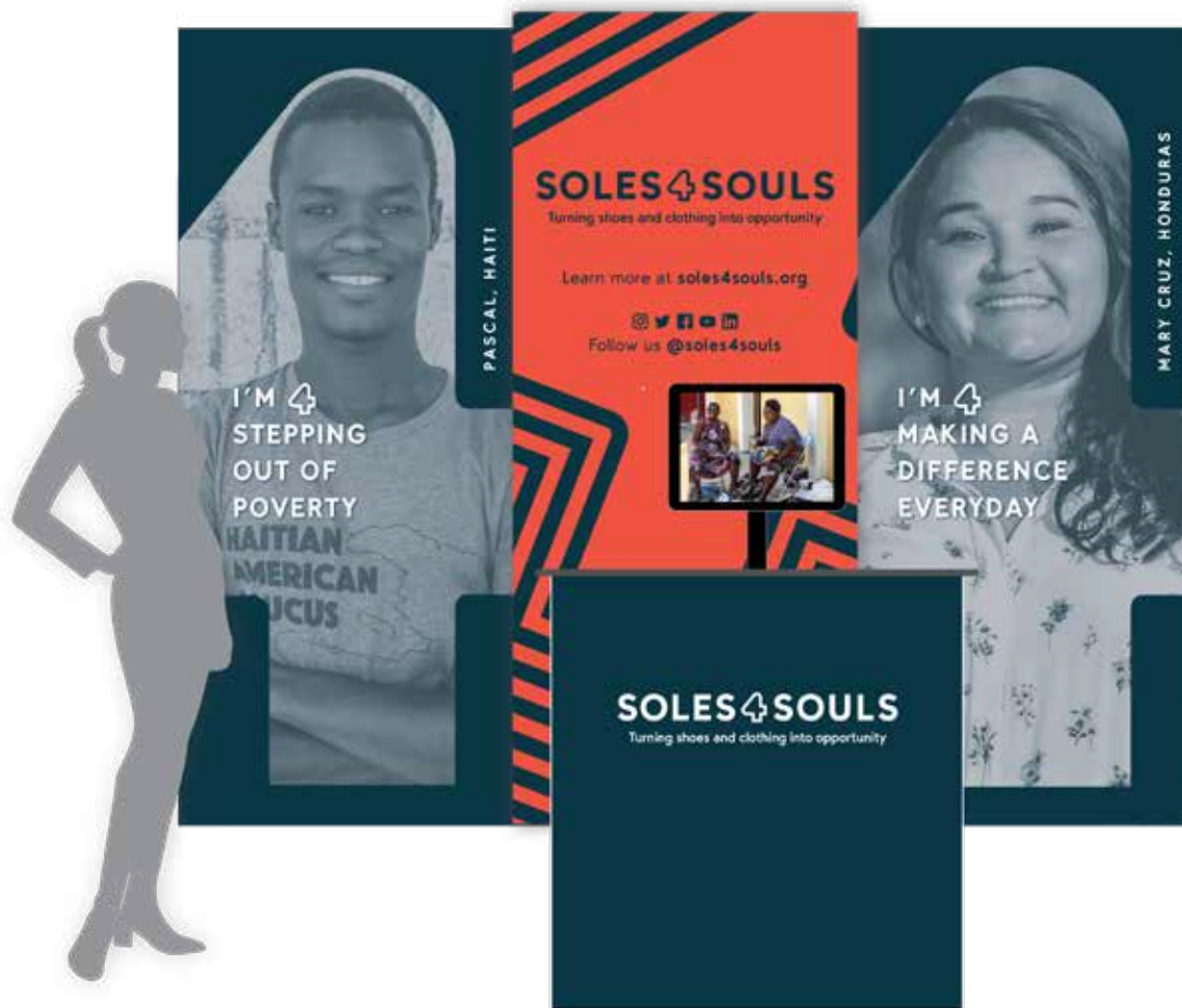
Concept of application for trade show kits.