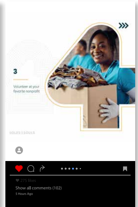
Concept of application in social media posts.